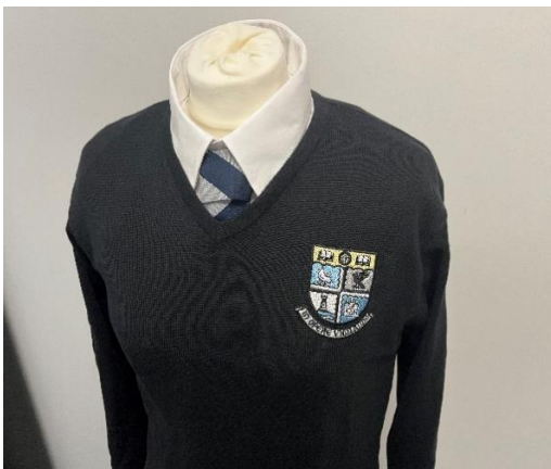
S1-S3 Uniform Examples