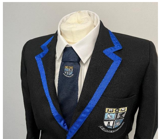
S4-S6 Uniform Example