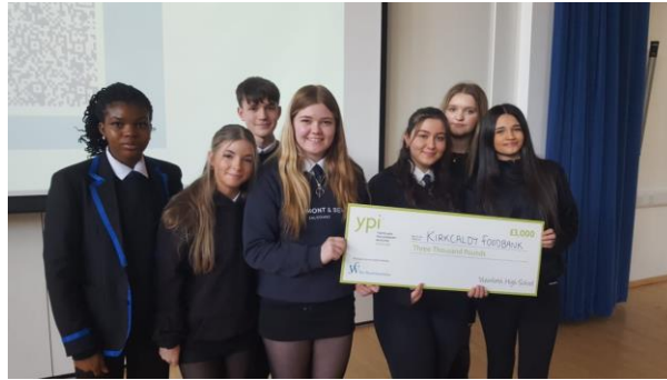
1 - The winning group with the cheque for £3000.